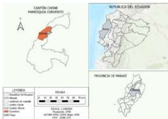
Figure 1. - Location of the study area

The Convento parish belongs to the Chone canton and it was created on December 13, 1954. In 2010, there was a total population of 6,578 inhabitants and a territorial extension of 30,365.48 ha. It limits to the north with the Chibunga and 10 de Agosto parishes; to the south with the parishes of San Isidro and Eloy Alfaro; to the east with the parishes of Eloy Alfaro, San Francisco de Novillo and the Flavio Alfaro canton; and to the west with the San Isidro and 10 de Agosto parishes and the Jama canton (GAD Parroquia Rural Convento, 2018) (Figure 1).