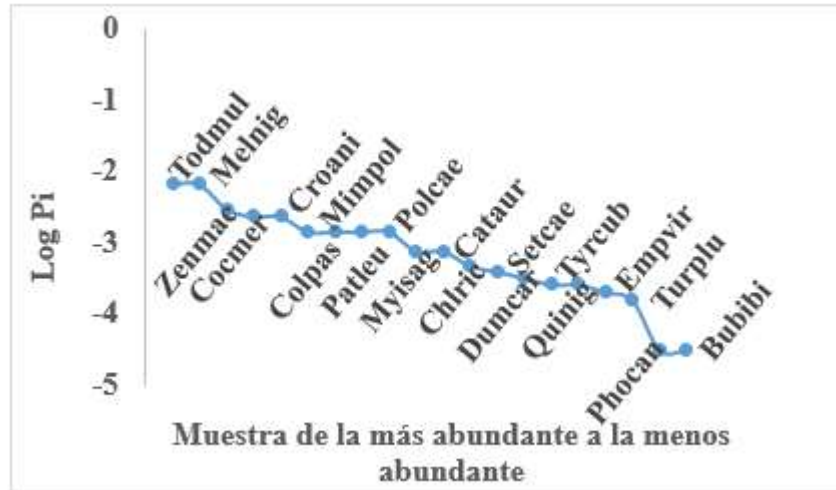
Figure 2- Whittaker curve or abundance range for the sites studied

Regarding the relative abundance of the species, the values obtained differ in each of them, Todus multicolor is the most abundant followed by M. nigra despite the fact that the latter is one of the most hunted species in the country. Similar results were obtained by Gómez (2019) in a study of bird communities in submontane rainforests in Alejandro de Humbolt National Park (Figure 2).