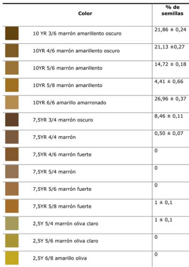
Table 2. - Colorimetric characterization of seeds with the Munsell color chart for soils to know their variability