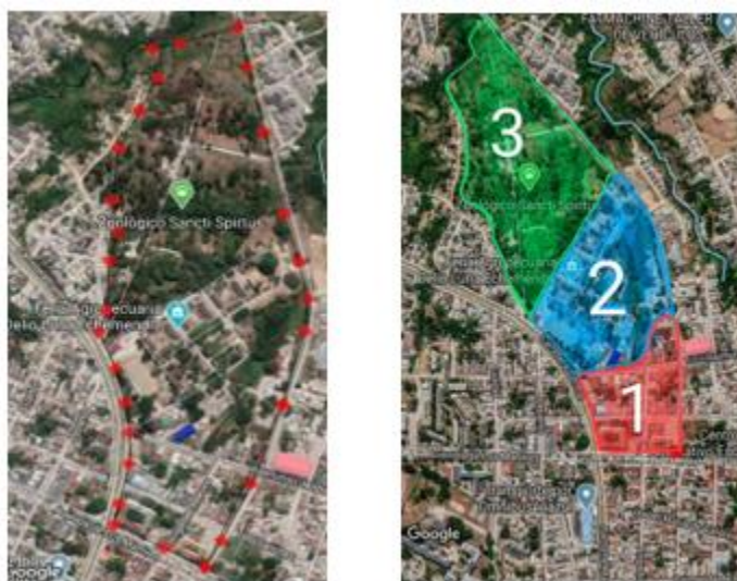
Figure 1. - Delimitation of the study area and establishment of the diagnostic polygons

An area of 25.39 ha was selected for this research, which is located at coordinates 21p 55'35.09" N 79p 26'03.63" W. (Figure 1). Two of the city's most important recreational parks are located there: the Agricultural and Livestock Fair and the Provincial Zoo.