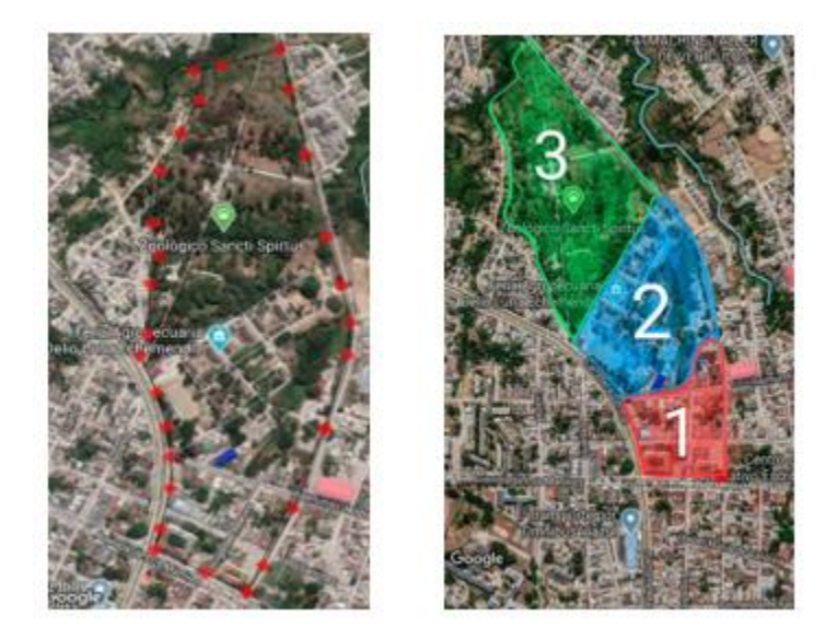
Figure 1. - Delimitation of the study area and establishment of the diagnostic polygons

An area of 25.39 ha was selected for this research, which is located at coordinates 21p 55'35.09" N 79p 26'03.63" W. (Figure 1). Two of the city's most important recreational parks are located there: the Agricultural and Livestock Fair and the Provincial Zoo.