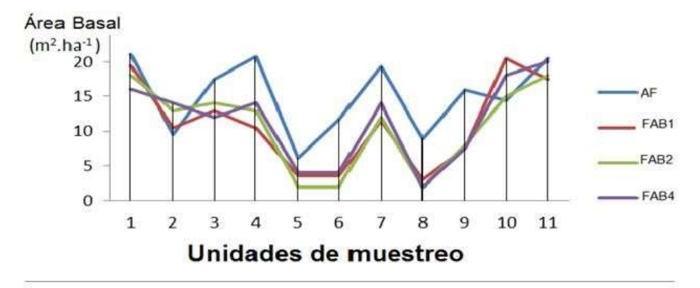
Figure 2 . - Distribution of basal areas in the sampling units, where FAB = fixed area and FAB 1, FAB 2 and FAB 4 are equivalent to Basal area factors 1, 2 and 4 respectively. Looking at the distribution of Gha<sup>-1</sup> in Figure 2, it is not possible to select the best FAB to estimate the basal areas in Miombo

Figure 2 shows the distribution of basal areas, where it is observed that except in plots 2 and 10 in the fixed area method, the estimated basal areas are higher than those obtained with the three FABs of Bitterlich, there is practically no difference between the three FABs (Figure 2).