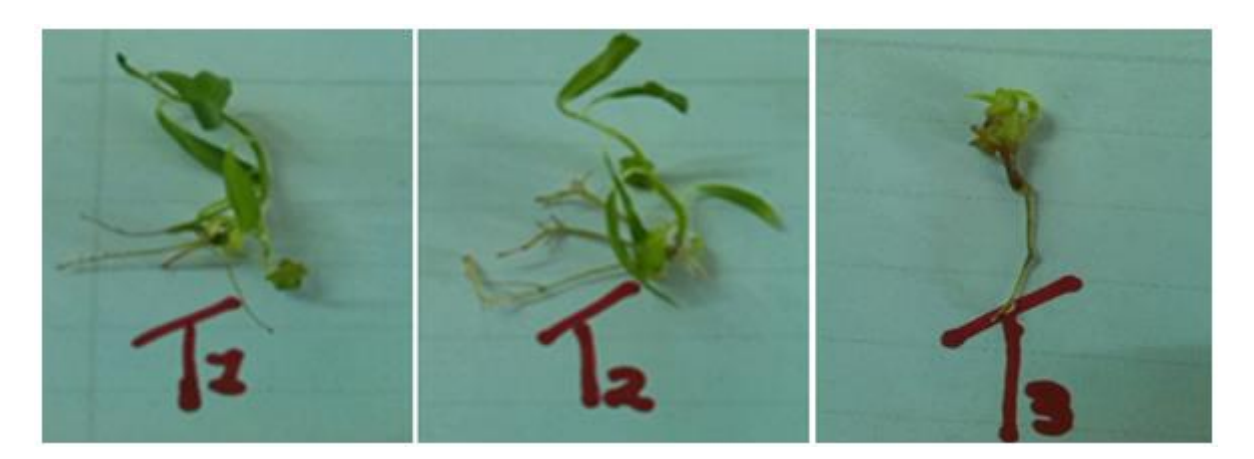
Figure 4 . - In vitro Salix babylonica plants rooted in MS culture medium at 28 days of culture

These results show that the increase in AIB concentration reduced the favourable behaviour in root induction, which caused a tendency to inhibit the rooting process, as shown in Figure 4.