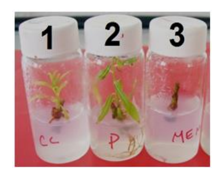
Figure 3. - In vitro plants of Salix babylonica in the different culture media used in multiplication, 1-1-T<sub>1</sub>, 2-T<sub>2</sub> and 3-T<sub>3</sub>

Figure 3 shows the development of the explants in each of the treatments used, which shows that not all had the same response in vitro, noting that the seedling in the middle Palomo-Ríos ( T_2 ) the shoot has a greater growth with emission of roots and leaves with a greater foliar area. In the Chung and Carrasco medium ( T_1 ) the shoot, roots and leaves show less development.