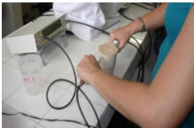
Figure 1. - Steinkamp BP-7 equipment for ultra-sound testing

The compounds are evaluated through the use of non-destructive testing, such as ultrasound, according to Beraldo and Martin (2007) , Correa et al., (2014) , in order to determine compatibility using the Steinkamp BP-7 equipment, which has exponential transducers of 45 kHz resonance frequency coupled (Figure 1).